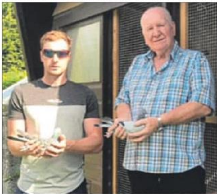
Davis &amp; Son.