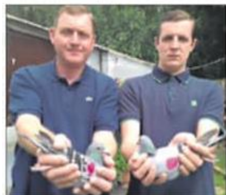
P. Jackson & Son.