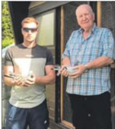
Davis & Son.